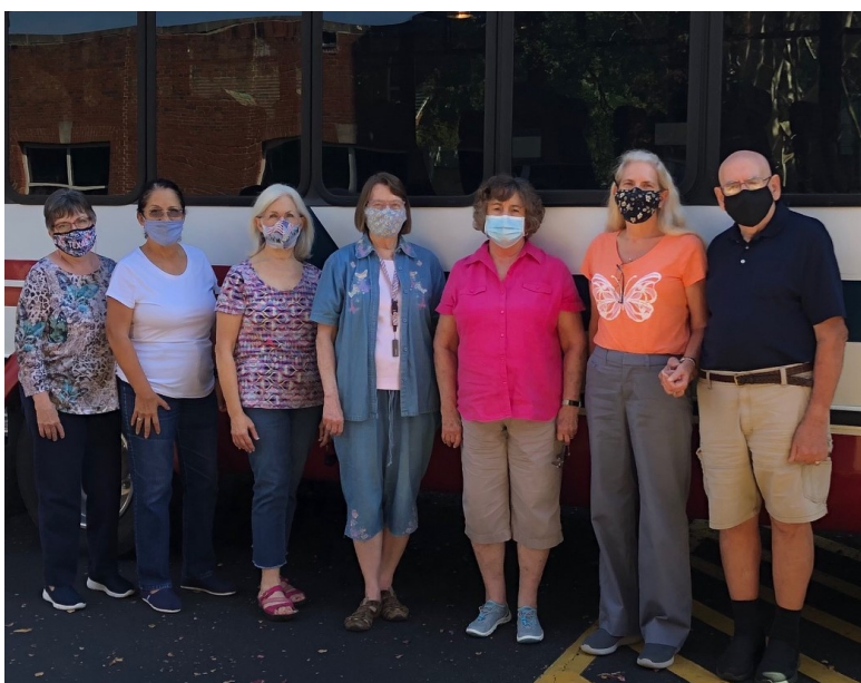
Participants of the August 17th BAGS—Clayton Library Research Trip

On day of the trip gather at 16511 Dianna Lane, Houston (Clear Lake) by 9:00 AM — BUS LEAVES AT 9:15 AM — returning by 4:00 PM later that day. A $3.00 (cash only) fee will be collected by the County Coordinator from all participants.