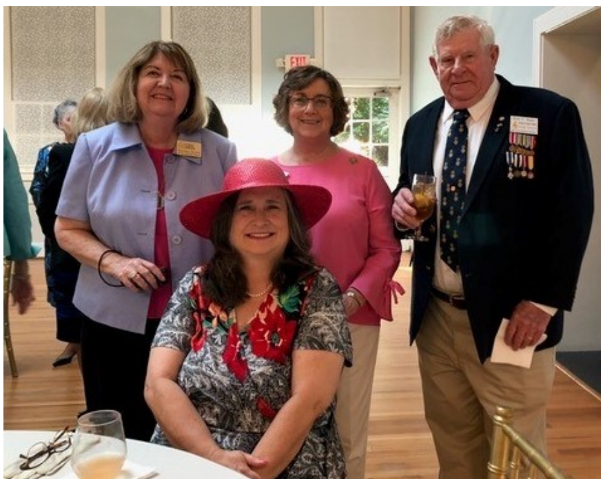
Photo was captured recently of members enjoying tea at the NSDAR, George Washington Chapter meeting on 17 June 2021, in Galveston, Texas.