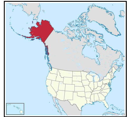
Alaska in United States, (from Wikimedia Commons)

www.census.gov/library/stories/2019/07/alaska-remote-areas-always-first-counted-decennial-census.html