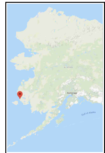
Toksook Bay, Alaska (from Google Maps)

For the 2020 Census, people will have the option to respond by mail, phone, or online. If you want to earn extra spending cash, consider working as an enumerator in your area (part-time, flex hours).