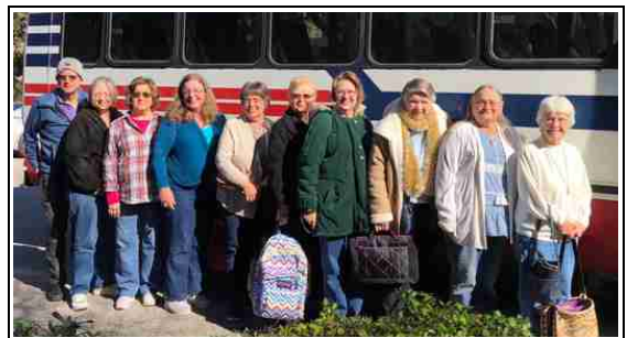
November 2018 Trip – members and friends visiting the Clayton Library