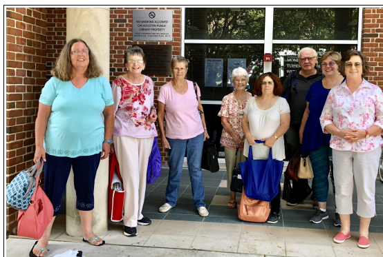
July 2018 Trip – members and friends at Clayton Library