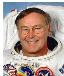
Jerry L Ross