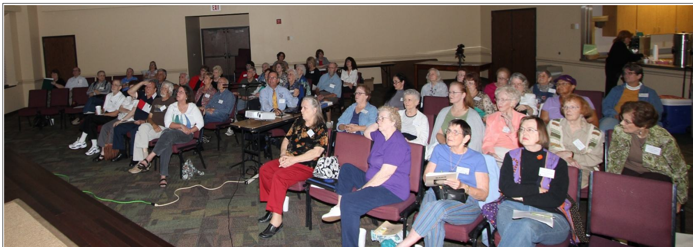
What a good looking bunch of people focused on research!