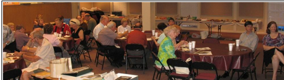
"Show and Tell" program in August 2012.

BAGS Bus Trip to Clayton Library is Thursday, August 22. Details on page 6.