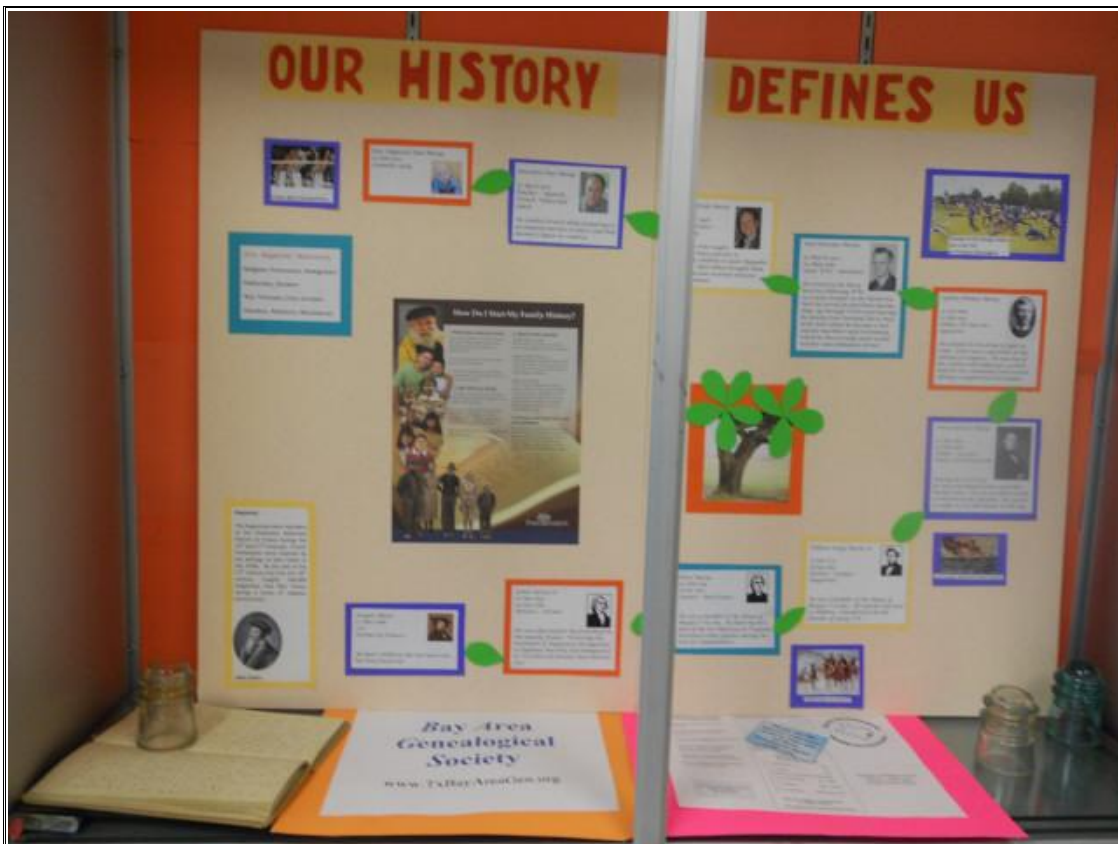
BAGS Display on exhibit during the month of February 2013 at the Parker Williams Branch Library , located at 10851 Scarsdale Boulevard, Suite #510, Houston, TX 77089 ( online map ). Library hours are Monday 1-9, Wednesday 10-9, Thursday 10-6, Friday 1-6, Saturday 10-5, closed Tuesday and Sunday.