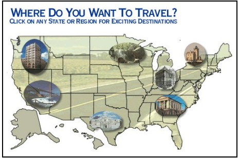
NPS "Travel Itinerary Series"

Access a list of travel destinations by region on the NPS "Travel Itinerary Series" webpage at www.nps.gov/history/nr/travel/index.htm. Scroll halfway down the page to this image and the regional lists will follow.