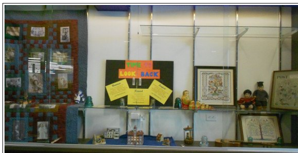
BAGS Display at Seabrook Branch Library

Polly Swerdlin setup a display of information promoting genealogy and BAGS during the month of June and July in the Evelyn Meador Branch Library located at 2400 North Meyer Road, Seabrook ( online map ).