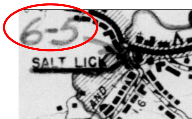
Portion of 1940 U.S. Census enumeration map of Salt Lick, Bath County, Kentucky (ED 6-5)

Looking at the 1940 Census enumeration map for that area, I was surprised to find just how much detail was included. The symbols on the map's legend account for different types of buildings either in use or not in use at that time. The map shows the location and type of business and residential structures, military facilities and land use in addition to the geological landmarks, roads and railroads. Now I know on April 2, 2012, I will look for Dad's relatives in ED 6-5.