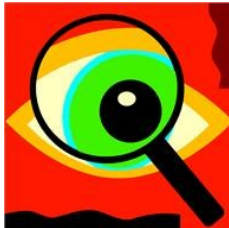
A search for strategies