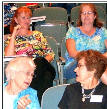
Left to Right & Top to Bottom