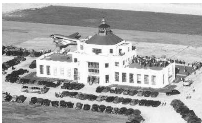
THE HOUSTON MUNICIPAL AIR TERMINAL: 1940-1954

- FROM 1940 AIR TERMINAL WEBSITE WWW.1940AIRTERMINAL.ORG