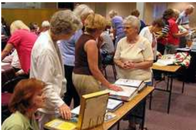
BAGS SHOW & TELL WITH POT LUCK DINNER IN AUGUST 2006