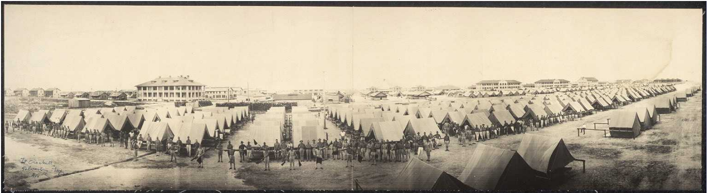
Ft. Crockett, Galveston, Tex., 1918, Digital ID: pan 6a3061