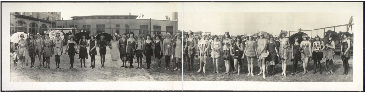
Contestants Bathing Girl Revue, Galveston, Tex., May 13, 1923, Digital ID pan 6a24584 , Library of Congress Prints and Photographs Division Washington, D.C. 20540 USA