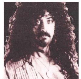
one persona of the Jean Laffite