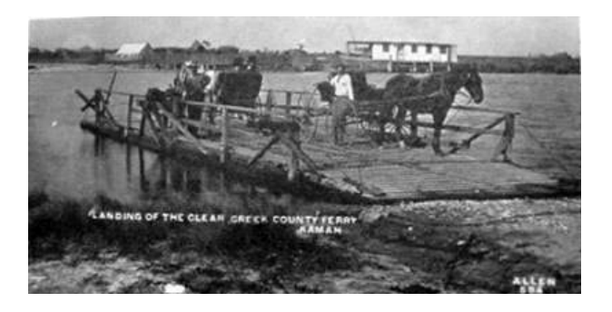
THE KEMAH FERRY (WWW.KEMAH.NET)