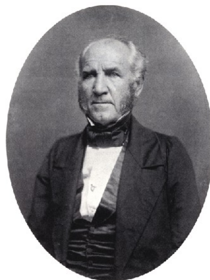
Senator Sam Houston