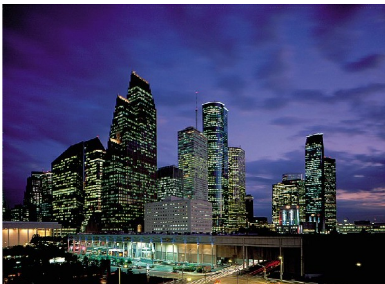
City of Houston