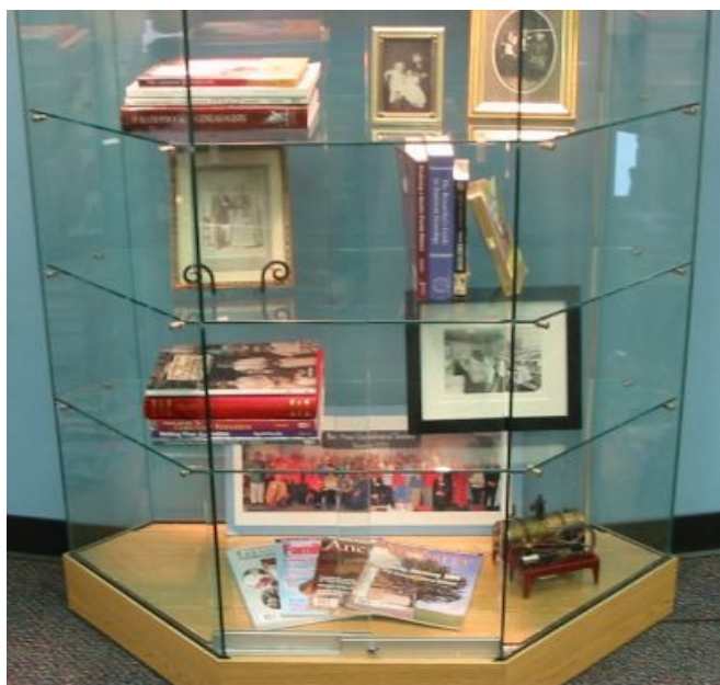
BAGS Exhibit at Friendswood Public Library January 2007