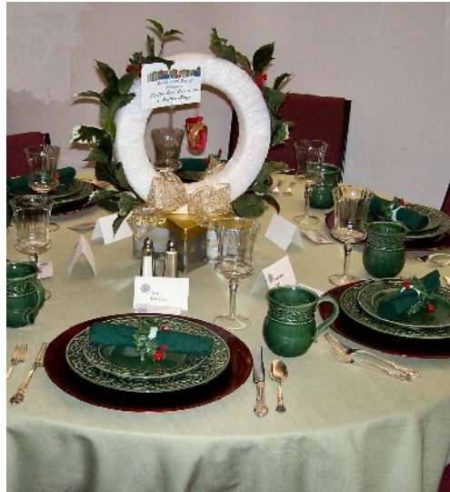
FIFTH DAY OF CHRISTMAS