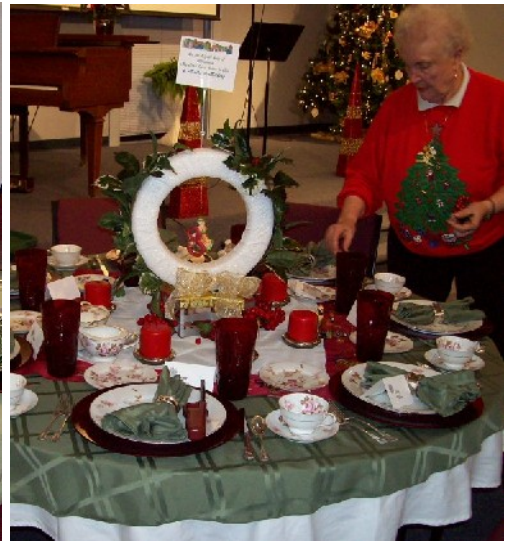
EIGHTH DAY OF CHRISTMAS