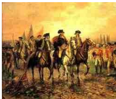
Cornwallis surrenders to George Washington, October 19, 1781