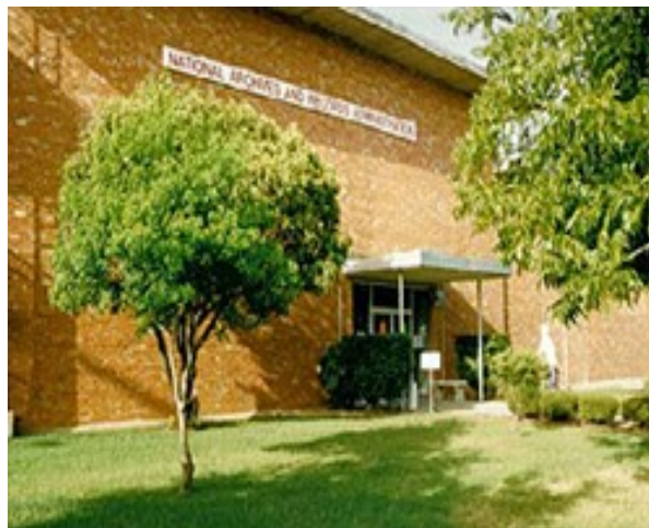
NARA Regional Archives Fort Worth, Texas