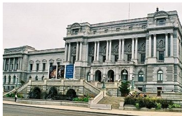
Library of Congress Washington, DC