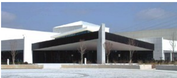
NARA Regional Archives Morrow, Georgia