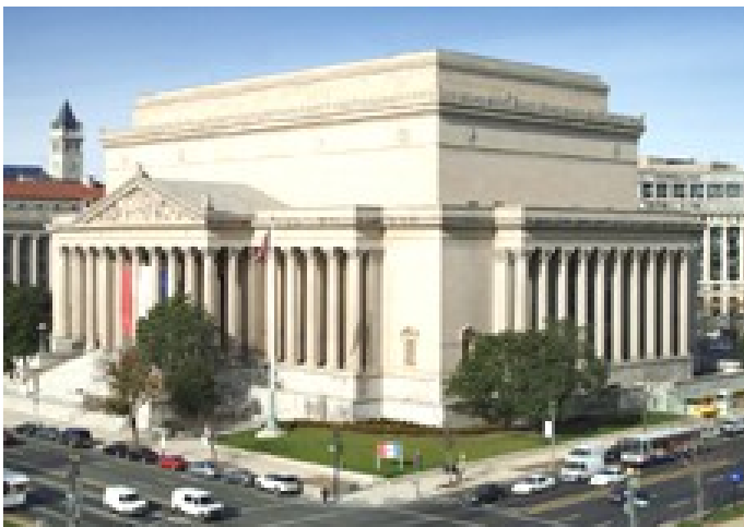
National Archives Washington, DC