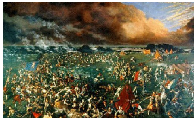
The Battle of San Jacinto