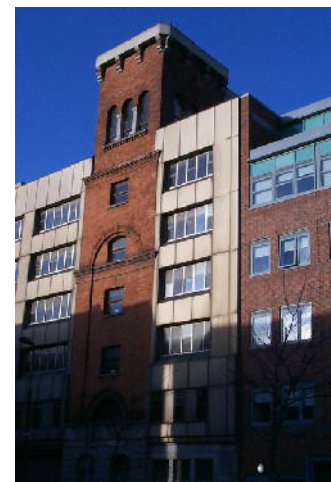
National Archive of Ireland -- Dublin