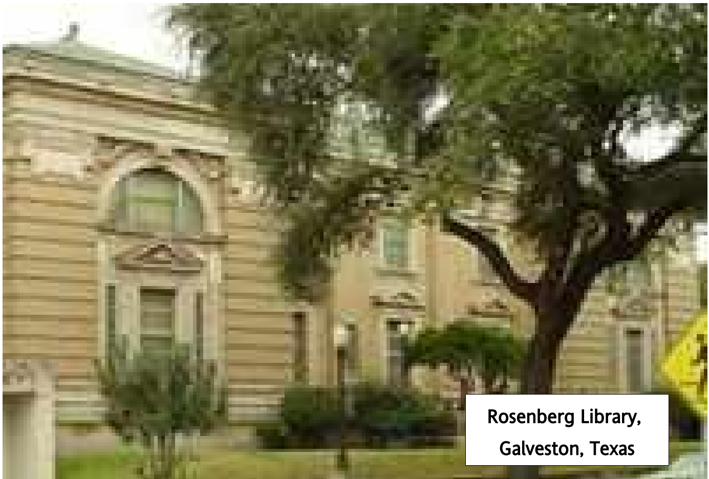
Rosenberg Library, Galveston, Texas