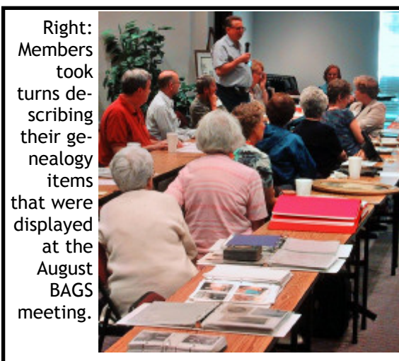
Right: Members took turns describing their genealogy items that were displayed at the August BAGS meeting.

Saturday, November 15, 2003: Clayton Library Annual meeting at the Tracy Gee Community Center, 3599 Westcenter Drive, Houston. Start time: 10:00am (one block east of Beltway 8 between Richmond Avenue and Westpark Drive). http://www.hpl.lib.tx.us/clayton/clf.html