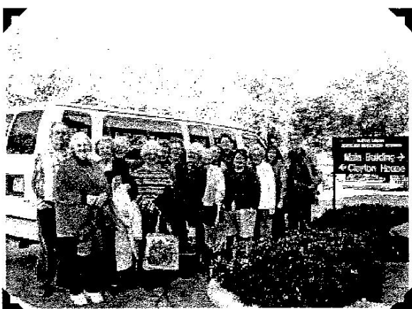
Research Trip to Clayton Library in February 2002 Church