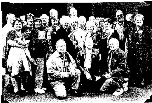
BAGS Group at Houston Forum